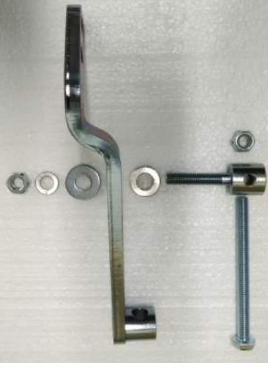
2.Exploded view of tensioning arm components – Note aluminum space between pin and arm may not be required.

1. First remove bolt(s) securing the original tensioning arm and the cover support bolt illustrated above.