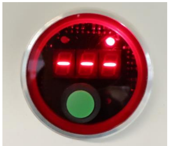
Feet selection shown

Holding the counter button of 8 seconds causes the display to flash "- - - ", releasing the button and pressing the button again causes the units to change with a resulting LED change.